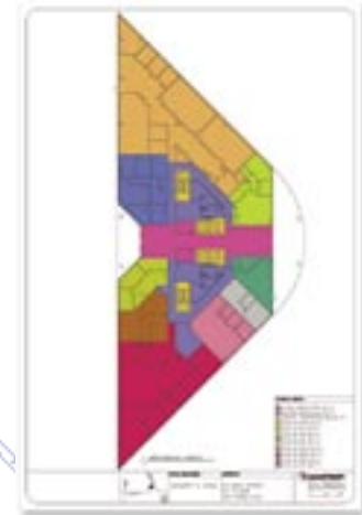
Commercial Office Space Measured to BOMA standards. Color mapping is used to group specific areas.